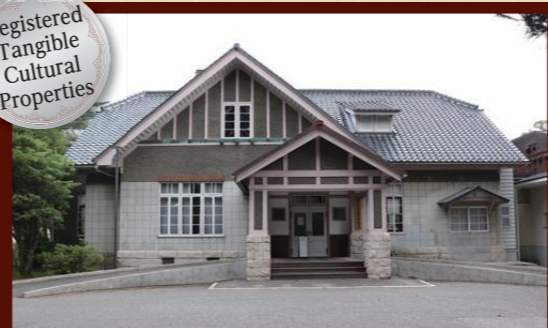
Old 9th Division Commander's Official Residence

Location : Dewa-machi 1-1 Year of completion : 1922