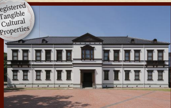
Old 9th Division Command Headquarters

Location : Dewa-machi 3-2 Year of completion : 1898