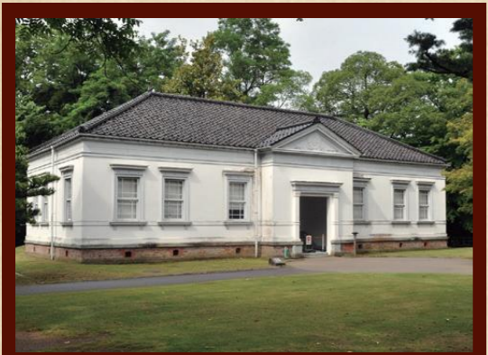
Old 6th Infantry Brigade Headquarters Location : Maru-no-uchi 1-1 Year of completion : 1898

A former army facility with great national value in the Kanazawa Castle grounds