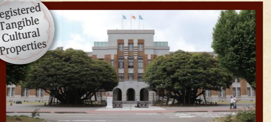
Former Ishikawa Prefectural Office