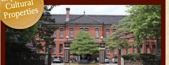
Former Fourth High School Main Building

Location : Hirosaka 2-2-5 Year of completion : 1891 Designed by : Hanroku Yamaguchi (Architect belonging to the former Accounting Bureau of the Ministry of Education)