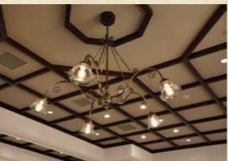
Latticed ceiling in the multipurpose room on the second floor

In contrast to the old 9th Division Command Headquarters that sits beside it, the Army Generals Club features a gorgeous exterior with elaborate baroque-style decorations. The highlights of the interior include the latticed ceiling and chandeliers in the multipurpose room on the second floor, which recreate the atmosphere of the Meiji era.