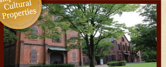
Old Kanazawa Army Armories

Location : Dewa-machi 3-1 Year of completion : 1909[Building3], 1913[Building2], 1914[Building1]