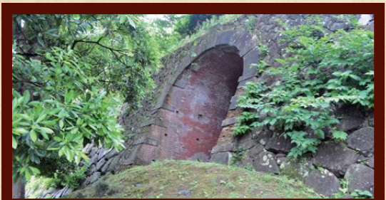
Old Army Ammunition Storage Tunnel Location : Maru-no-uchi 1-1 Year of completion : unknown

The only remaining brick structure in the Kanazawa Castle grounds