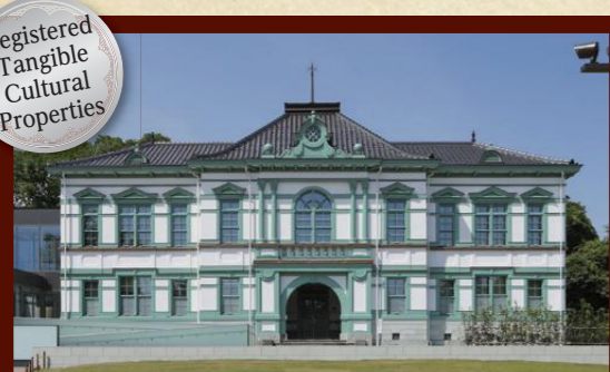
Old Army Generals Club

Location : Dewa-machi 3-2 Year of completion : 1909