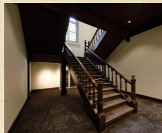
Zelkova wood staircase

The building's symmetrical two-story wooden exterior is typical of government buildings of the time. Interior features representative of Western-style architecture during the Meiji era including the stately zelkova wood staircase and plaster reliefs on the ceiling have been maintained or restored, allowing visitors to feel the atmosphere of the time.