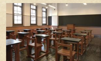
A restored classroom

Originally the main building of the former Fourth High School, this red brick building has served as Kanazawa University and the Ishikawa Prefectural Museum of History since its closure. It currently houses the Fourth High School Memorial Museum, along with the Ishikawa Museum of Modern Literature, which introduces literary figures related to Ishikawa Prefecture. This treasured building still retains its original appearance, layout and structure, providing a clear window into the past.